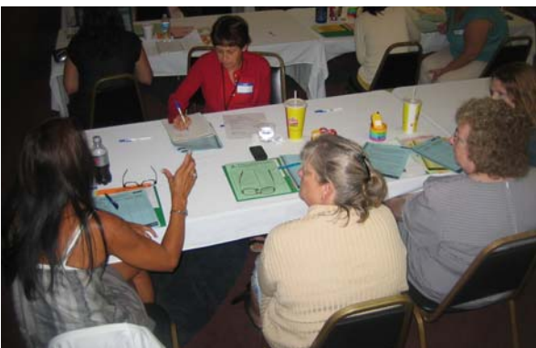
School based mental health professionals and educators at a workshop on August 16-17.

The Marshall School Health Technical Assistance Center assists the ESMH Initiative through such activities as strategic meetings, development of school mental health resources and toolkits, an annual conference, a new website, and webinars and workshops for school mental health and education personnel. Last August the Back to School workshop featured suicide prevention training and "Eliminating Barriers for Learning," a four-part curriculum developed by the Substance Abuse and Mental Health Services Administration.