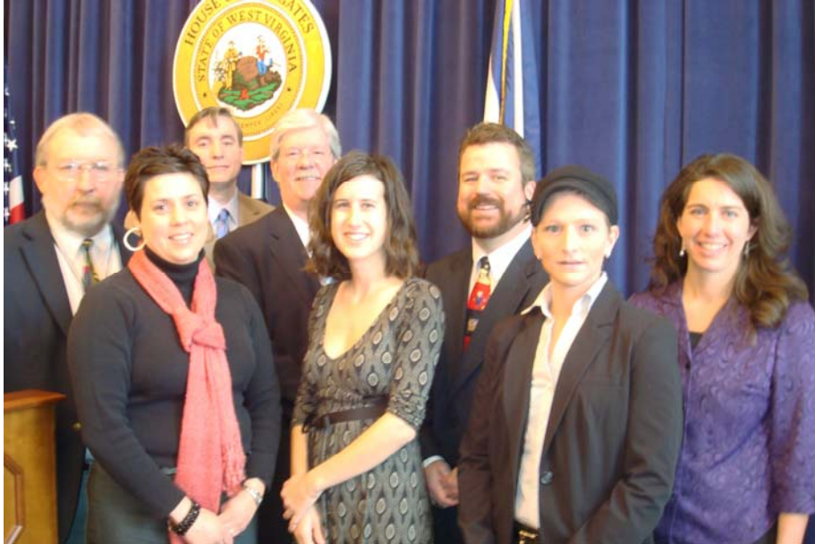
Presentation to the Women's Caucus at the Legislature on children's issues (WVCAN and other allies of children).

Is child abuse a significant problem for West Virginia? Yes, but WVCAN believes that by working together we can continue to ensure that children are receiving the high-quality services they deserve. A child in Welch should have access to the same services as a child in Philadelphia. These are our children, our neighbors, our families.